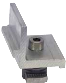
Pre-assembled cross connector PXC