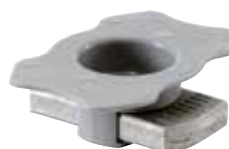
Channel nut FCN AL