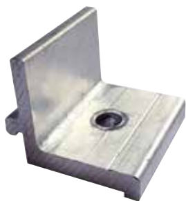
Cross connector XC AL