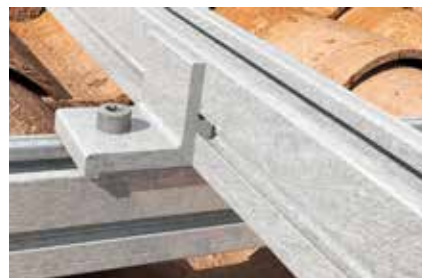
Detail: cross connector