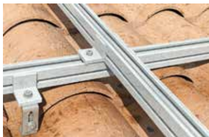
Profiles solar cross connection