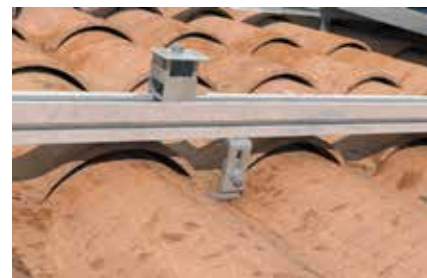
Detail: Hook GTR