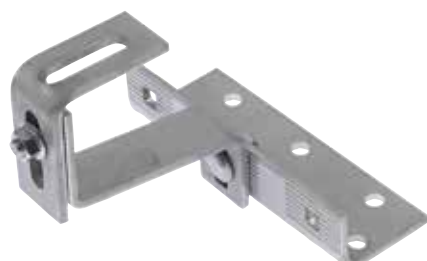
Adjustable tile hook GTR A2