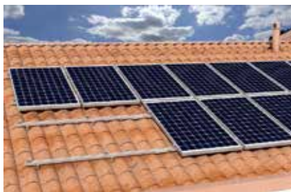
Pitched roof with tiles